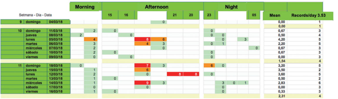
Fig. 6. "Pain map" of a patient.