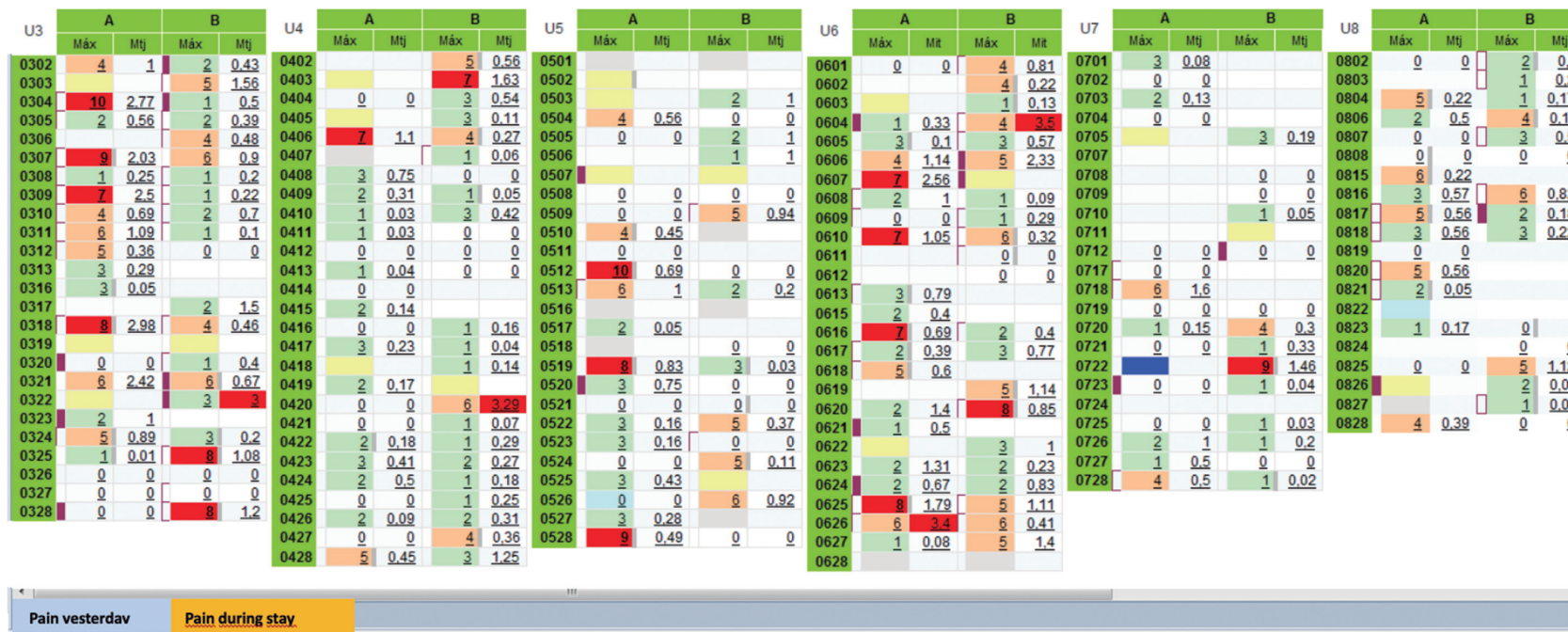
Fig. 3. "Pain map" during hospital stay.

Pain during stay: out of 458 occupied beds, 387 measured (84.5%) and 121 with pain (31.27%), 114 in the postoperative period, 27 in first 24 hours postoperative